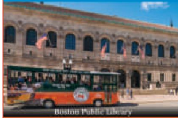
Boston Public Library