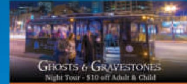
GHOSTS & GRAVESTONES Night Tour - $10 off Adult & Child